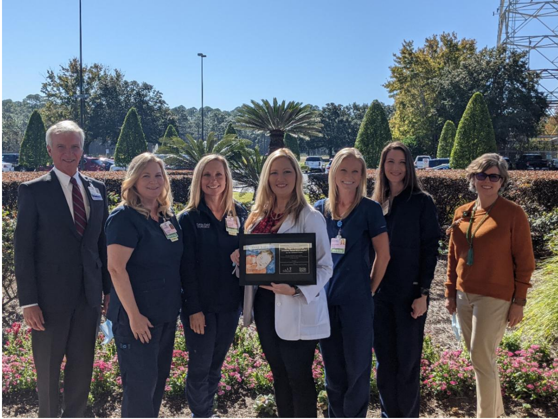
Pictured above: Staff and Administration from the Ascension Sacred Heart Hospital on the Emerald Coast's Family Birth Place