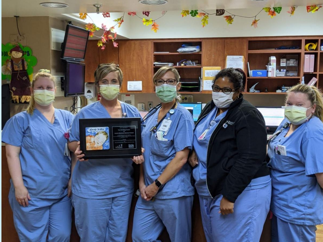
Pictured above: Staff and Administration from the North Okaloosa Medical Center's Birthing Center