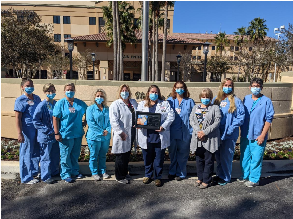
Pictured above: Staff and Administration from the Fort Walton Beach Medical Center's Women's and Children's Center