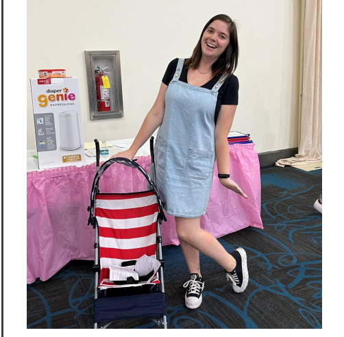
A new mom shows off the stroller she won playing the Price is Right at the Baby Shower